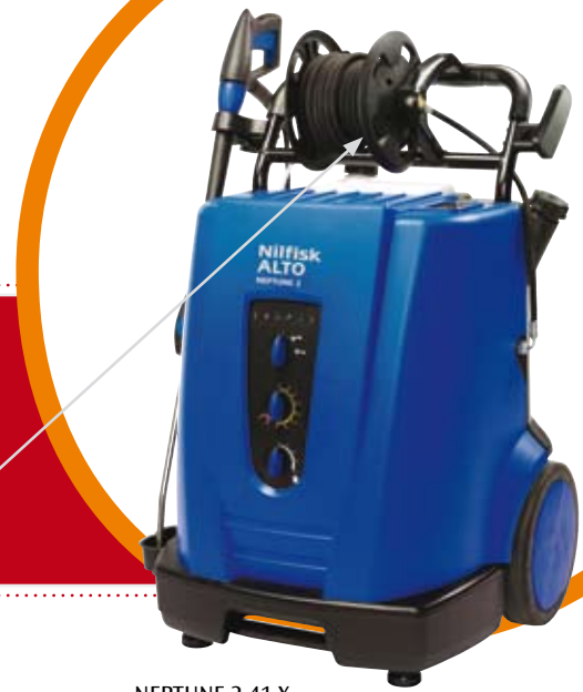
NEPTUNE 2-41 X