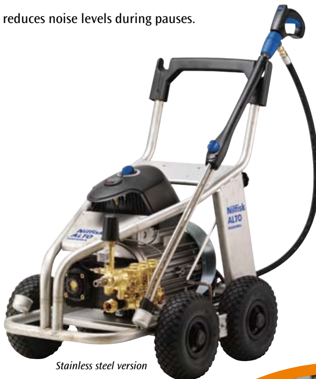
Stainless steel version